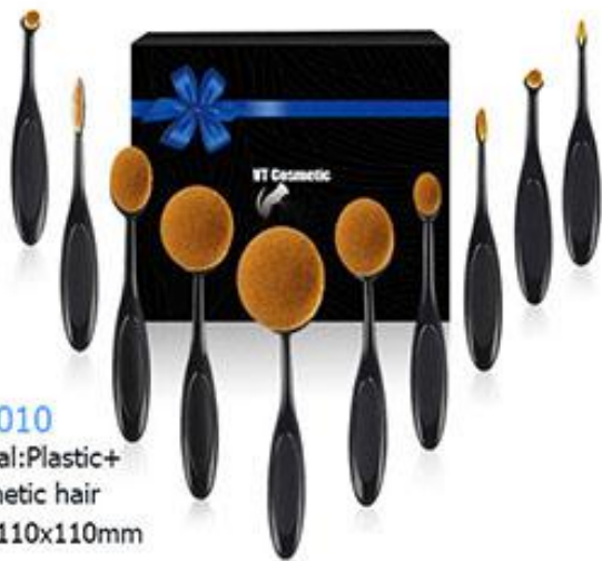
BS1010 Matrial:Plastic+ synthetic hair Size:110x110mm