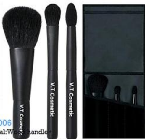
BS1006 Material: Wood handle + synthetic hair + velvet pouch