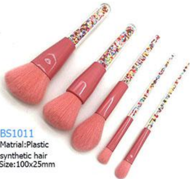
BS1011 Matrial:Plastic synthetic hair Size:100x25mm