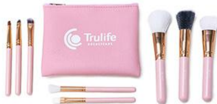
BS1001 Material: Wood handle + synthetic hair + PU bag Size: 170x120mm