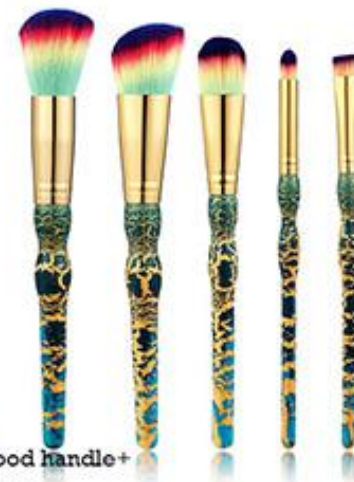
BS1009 Matrial:Wood handle+ synthetic hair