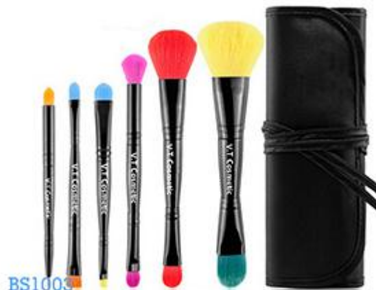
BS1003 Material: Wood handle + synthetic hair + PU bag