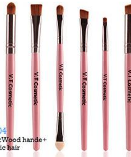
BS1004 Material: Wood handle + synthetic hair