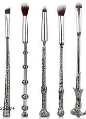
BS1005 Material: Metal body + synthetic hair