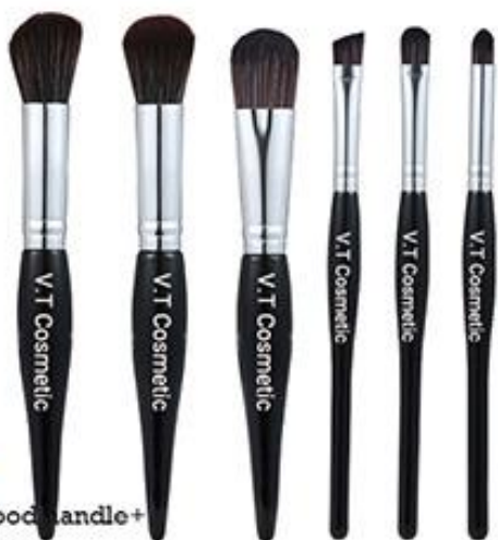
BS1007 Matrial:Wood handle+ synthetic hair