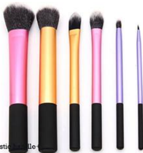
BS1008 Matrial:Plastic handle+ synthetic hair