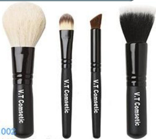
BS1002 Material: Wood handle + synthetic hair