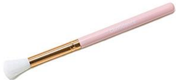
EB2010 Matrial:Wood handle+ synthetic hair Size:140x8mm