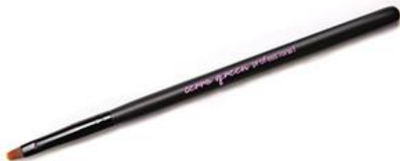
EB2014 Matrial:Wood handle+ synthetic hair Size:137x6mm