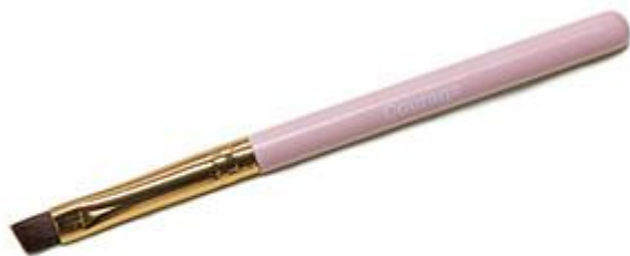
EB2013 Matrial:Wood handle+ synthetic hair Size:128x8mm