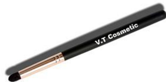
EB2016 Matrial:Wood handle+ synthetic hair Size:150x6mm