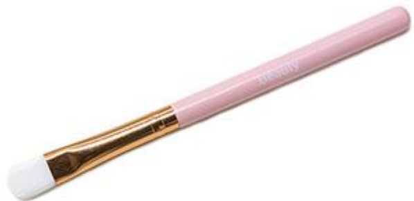
EB2009 Matrial:Wood handle+ synthetic hair Size:135x8mm