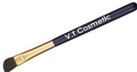
EB2015 Matrial:Wood handle+ synthetic hair Size:150x8mm