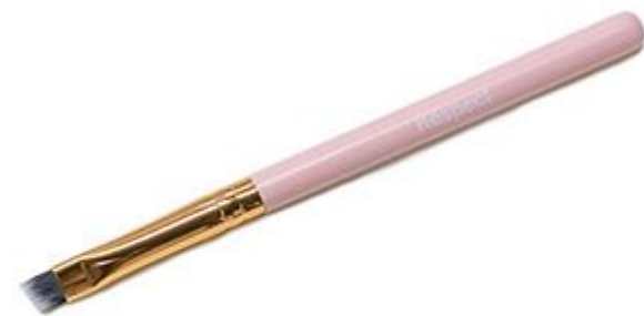
EB2012 Matrial:Wood handle+ synthetic hair Size:130x8mm